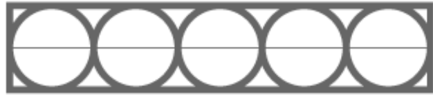
PIPE LENGTH (DIAMETER X 5)